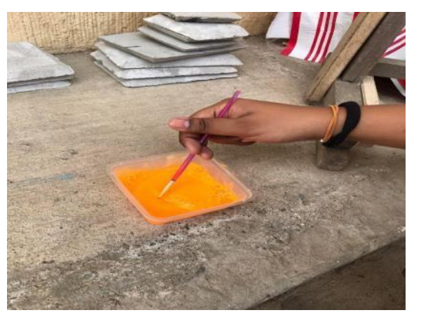
Fig. 5. Mixing of Epoxy Resin and GiD Powder

The plastic molder, shown in Fig. 3, played a key role in shaping the epoxy resin in the cured concrete specimens. The molder, made of plastic, served as a container for the mixture of epoxy resin, hardener, and Glow Powder. This mixture was poured into the concrete specimen inside the molder. Subsequently, the specimen was left to cure and harden, resulting in a solid block that could be easily removed from the mold after a 24-hour curing period.