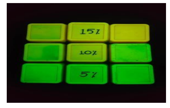
Fig. 11. Glow-in-the-dark concrete topping-based road marking

The findings indicate that increasing the GiD component from 5% to 10% resulted in a 19.73% increase in intensity, while further increasing it from 10% to 15% led to a 23% gain in intensity. Moreover, the duration of emitting light from the GiD RPM significantly influenced the glow intensity. Previous studies have suggested that beyond a GiD component of 30.53%, the performance gains become negligible relative to the associated cost increase [34]. Therefore, it can be inferred that a GiD proportion of 15% is desirable in terms of achieving the desired glow intensity and duration.