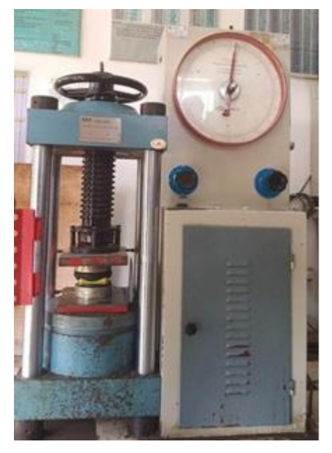
Fig. 10. ASTM D4280 Compressive Strength Machine

The developed GiD RPM prototype underwent fatigue testing according to the ASTM D4280 standard (ASTM, 2018a), as shown in Figure 13. The purpose of this test was to assess the performance of the prototype when subjected to flexural compressive loading caused by the passage of vehicle tires [34]. The objective was to simulate the real-world conditions in which the GiD RPM is exposed to compressive forces generated by passing vehicles.