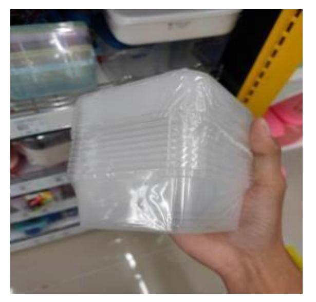
Fig. 3. Plastic Molder