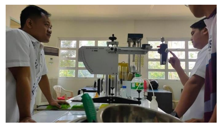
Fig. 9. Skid Resistance Number Tester

Based on this information, the objective of the current study is to develop a GiD-based RPM that can perform better in SRN tests. To achieve this, the developed prototype was evaluated under three environmental conditions: (a) sandy, (b) wet, and (c) dry. The evaluation was conducted following ASTM E303-93(2018) standards (ASTM, 2018b). The purpose of the test was to assess the performance of the prototype under each weather condition while simulating speeds of up to 50 kph.