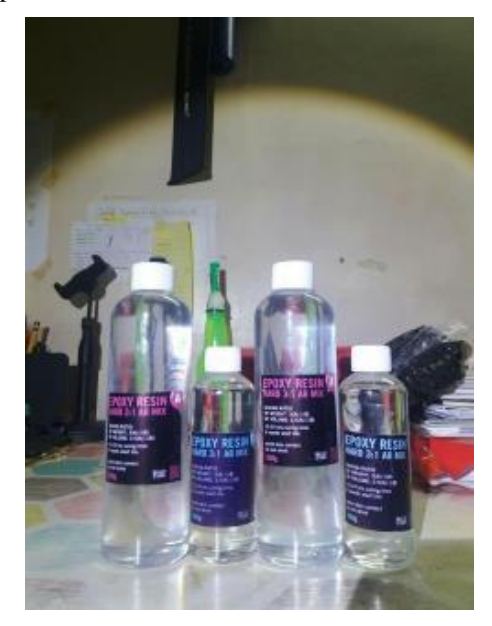
Fig. 1. Epoxy Resin and Hardener

substance used in construction to solidify and bond materials together, was purchased from a local supplier. Grade 100 Portland cement was specifically used in this study. Fine aggregates, typically natural sand, were utilized to ensure the durability of the concrete. Water, an essential component in the concrete production and curing process, played a crucial role in determining the strength and quality of the concrete used. It was important for the water to be of drinking quality and free from impurities.