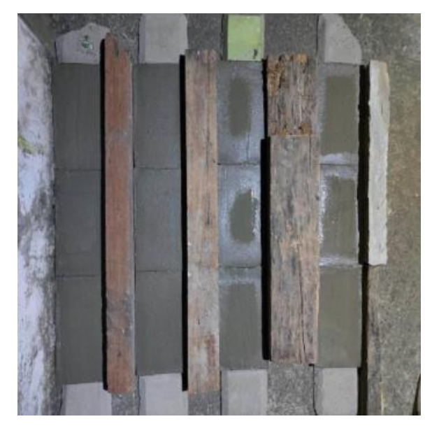
Fig. 4. Curing of Trapezoidal Concrete