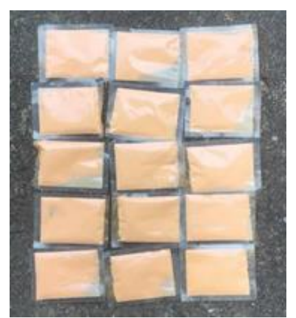
Fig. 2. GiD Powder

In addition, epoxy resins were employed in the study due to their high performance and suitability for extreme conditions. These resins can be customized by adjusting the resin, modifier, and crosslinking agent to meet specific requirements. The ratio of epoxy resin to hardener used in this study was 2:1. To introduce the glow-in-the-dark effect, glow-in-the-dark (GiD) powder was incorporated. This powder is cost-effective and can be charged by various light sources, such as sunlight or white light bulbs, and it exhibits luminescence under black light. Three types of GiD specimens were created, each with different percentages of GiD powder: 5%, 10%, and 15%.