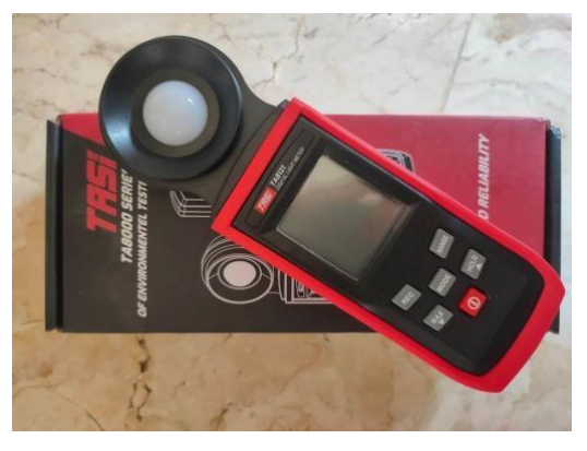
Fig. 7. Photometer

Furthermore, the distance of the light source was adjusted to ensure uniform coverage of the entire surface of the GiD RPM. Three samples with different percentages of GiD material addition (5%, 10%, and 15%) were tested with an excitation time of 5 minutes. The glow-in-the-dark effect was measured after three different durations: 5 minutes, 10 minutes, and 15 minutes. After switching off the flashlight, the photometer was placed on top of the samples after a 30-second interval.