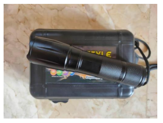
Fig. 8. UV Flashlight

The Traffic Safety Division conducted an extensive review of the skid performance of commercially available RPMs. The study involved testing 14 different types of samples using the British Pendulum Number (BPN) test, as shown in Fig. 9. The researchers found that the RPMs exhibited an average skid